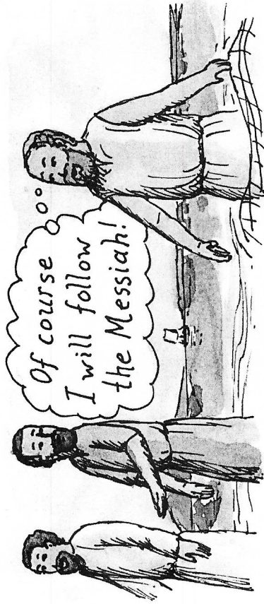
Answer to front page: We have found the Messiah! Answer to Cross-Word: his vocation.

God does not call all of us to very important jobs like the prophet Samuel and Saint Peter. But each of us should follow Jesus and be ready to do His will. If we always try to do what God wants, then we will be ready if He does have a special job for us! How can you do God's will today?