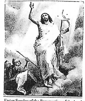
Easter Sunday of the Resurrection of the Lord

Mission Statement: We bring together a parish family to worship God, to evangelize the community, to encourage participation of youth and young adults in parish life, to pass on our faith to the next generation, to respect life and be good stewards of God's gifts.