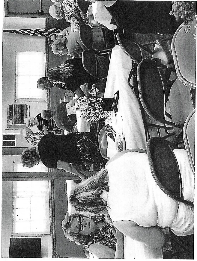
2024 Annual Summer Picnic