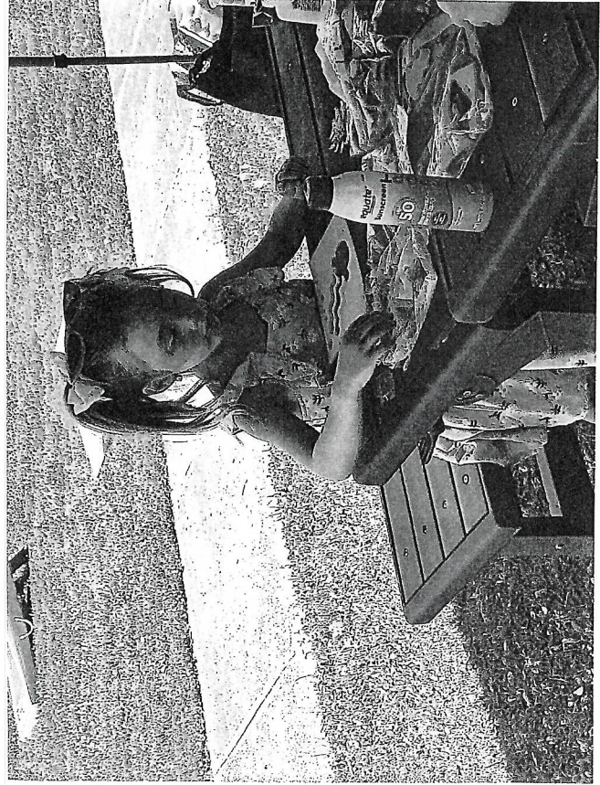
2024 Annual Summer Picnic