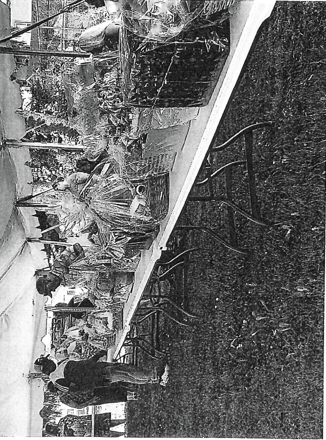
2024 Annual Summer Picnic