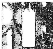
The Sanctuary Lamp The light that symbolizes the Eternal Sacrifice