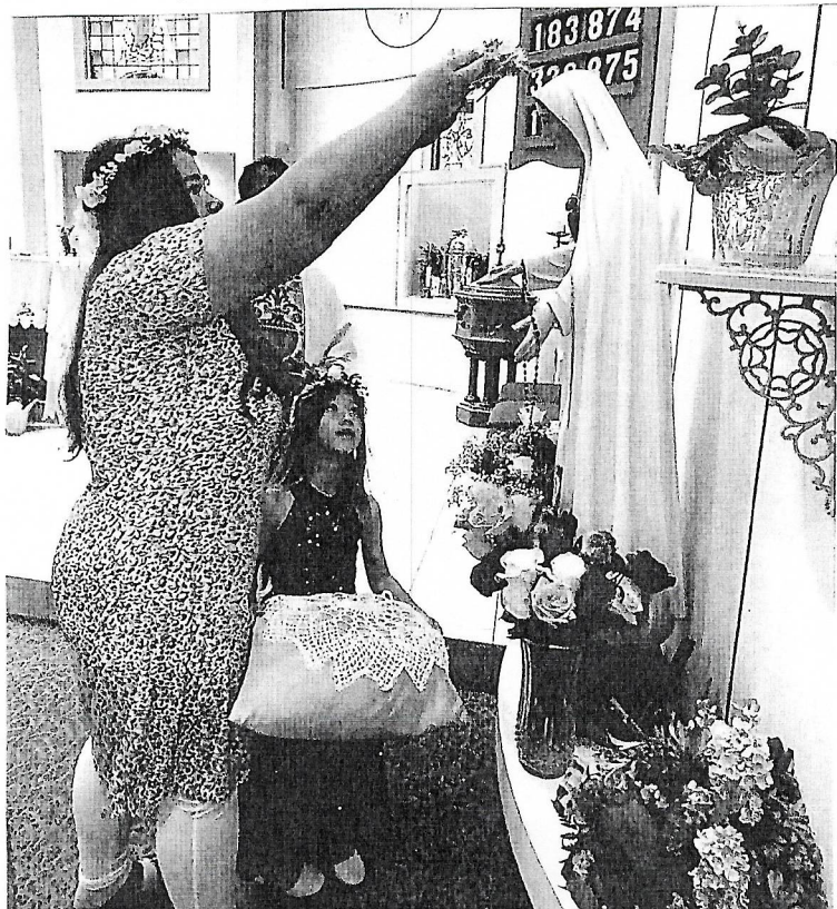
May Crowning of The Blessed Virgin Mary.

Next picnic meeting is Tuesday, May 27 th at 5:30 PM