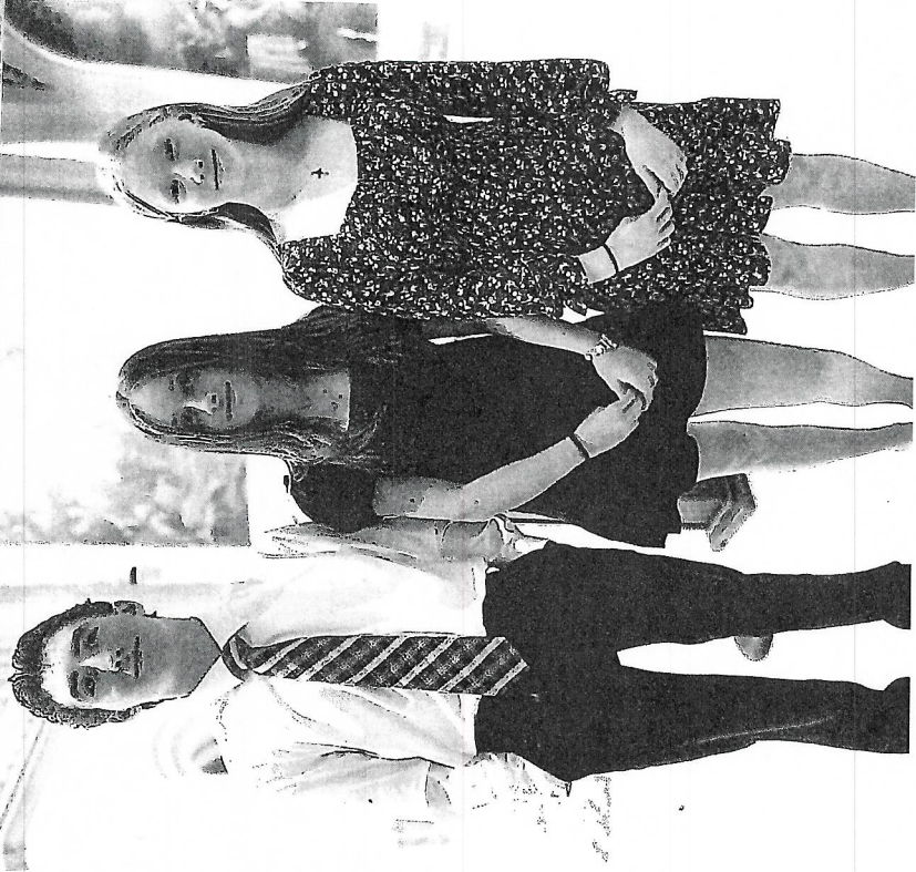
Bishop Youth Awards